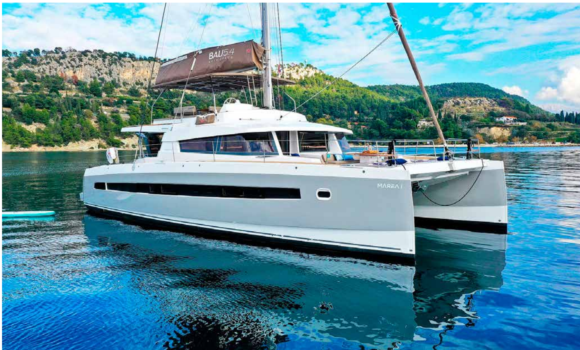
●●● Sailing Catamaran Bali 5.4 - Marea I